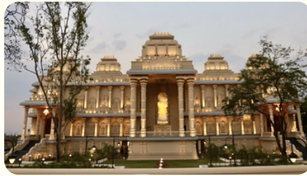
Bharatiya Vidya Bhavan's Sanskritik Kendra