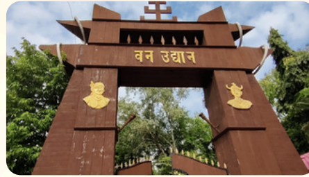
Japanese Rose Garden