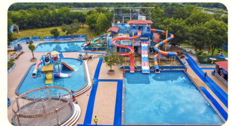
Lighthouse Water Park