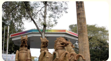
Zero Mile Stone