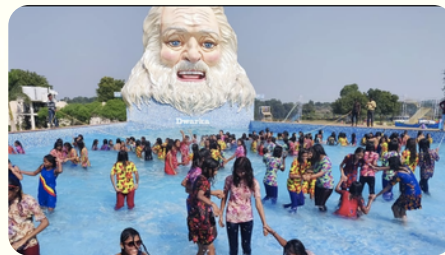
Dwarka Water Park