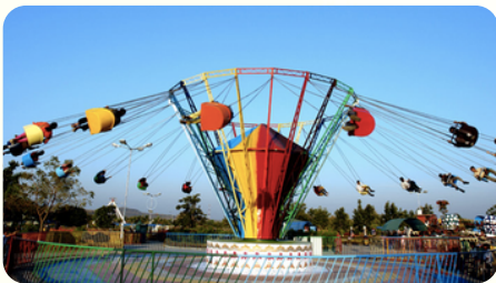
Fun 'n' Food Village Nagpur