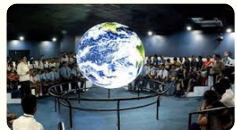
Raman Science Centre