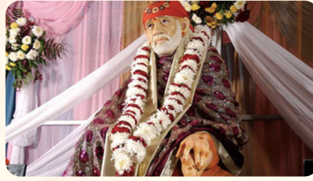
Sai Baba Temple