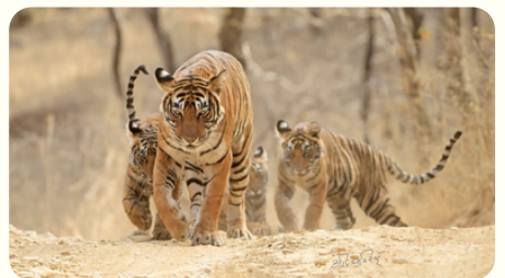
Tadoba Tiger Reserve