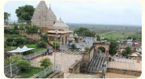
Adasa Ganpati Temple