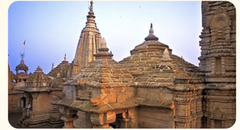
Ram Temple, Ramtek