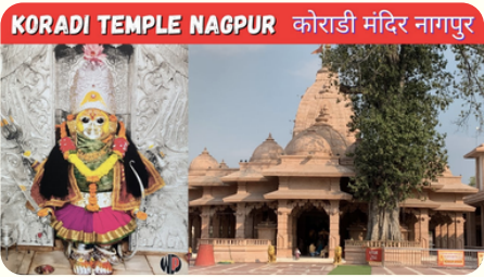
KORADI TEMPLE NAGPUR कोराडी मंदिर नागपुर